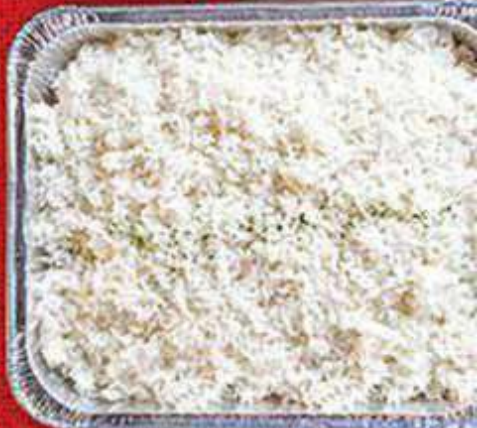
ARROZ BLANCO WHITE RICE HALF FULL