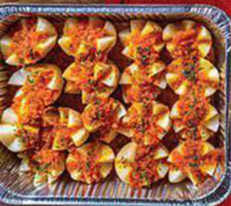
PAPA GUISADA BOILED POTATOES WITH SAUTEED ONIONS AND TOMATOES HALF FULL