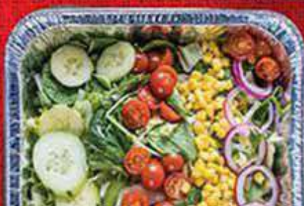
ENSALADA DE LA CASA HOUSE SALAD HALF FULL