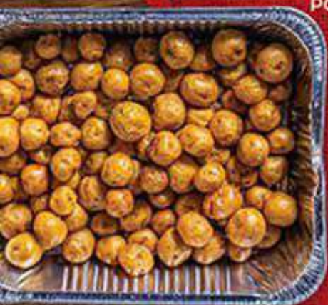
PAPA CRIOLLA HALF FULL