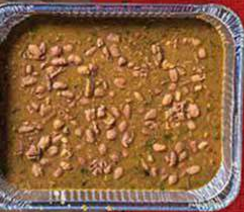
FRIJOLE BEANS HALF FULL