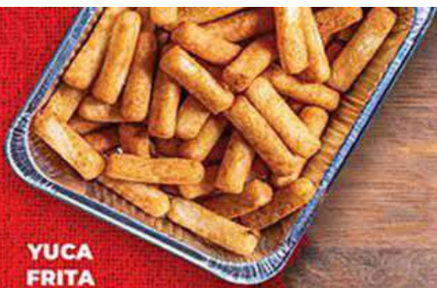
YUCA FRITA FRIED YUCA HALF FULL