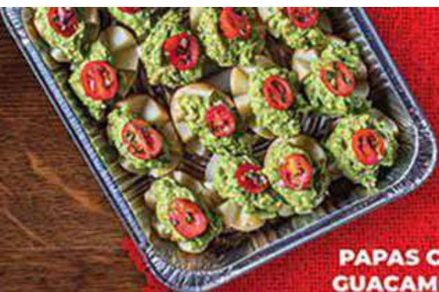
PAPAS CON GUACAMOLE POTATOES AND GUAC HALF FULL