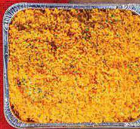
ARROZ AMARILLO YELLOW RICE HALF FULL